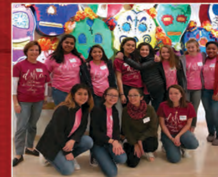
DSHA volunteers enjoy the Latino Arts Day of the Dead exhibit before helping the seniors with a spa day.