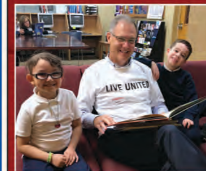
Robert W. Baird & Co., Inc. Lives United by reading to our first grade students during the United Way Season of Caring