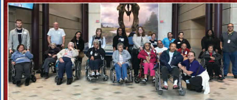
US Bank takes UCC seniors on a fun adventure to the Milwaukee Public Museum

¡Muchas Gracias! A warm and heartfelt thank you goes out to all of the volunteers who have made and continue to make a huge impact by supporting UCC clients and programs!