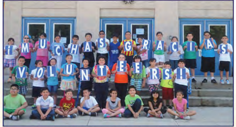
Thank you to all volunteers who have made a huge impact by donating their time and energy to UCC programs.