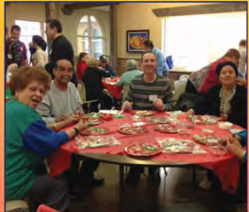
Volunteers from Johnson Controls decorated holiday cookies with UCC seniors and spread holiday cheer when they delivered the treats to residents of Olga Village and the UCC US Bank Village.