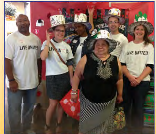
AXA Advisors had a blast showing off their moves in a dance competition with our Senior Center clients.