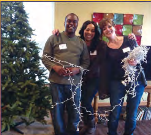
Brady Corporation shares their holiday spirit by baking cookies and decorating residential homes.