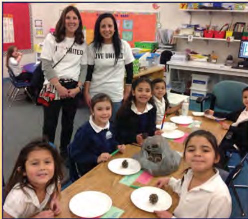
United Way Season of Caring ends with Rockwell Automation volunteers helping out BGCS K5 students in a fun holiday craft.