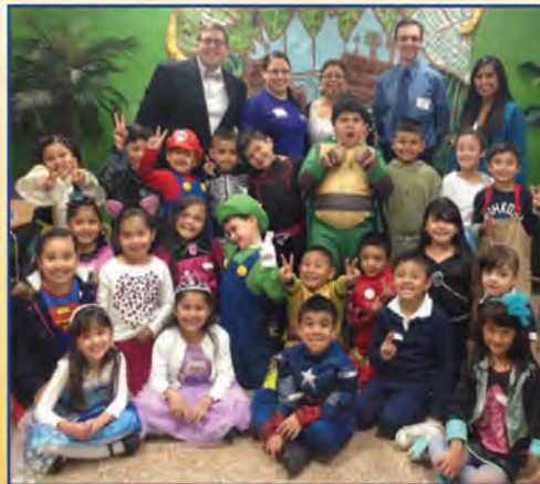
US Bank volunteers read spooky Halloween books to 1st grade BGCS students during United Way Season of Caring.